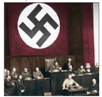
Hitler announces the Enabling Law.

The "discussions" which the members of the Cabinet and various non-Nazi Party leaders conducted with Hitler, during March 1933, about various clauses and features of the Enabling Law, were coloured by the following principal delusions: 1) Hitler was a "German" politician, just like them, and therefore would "play by the same rules"; 2) Hitler could be