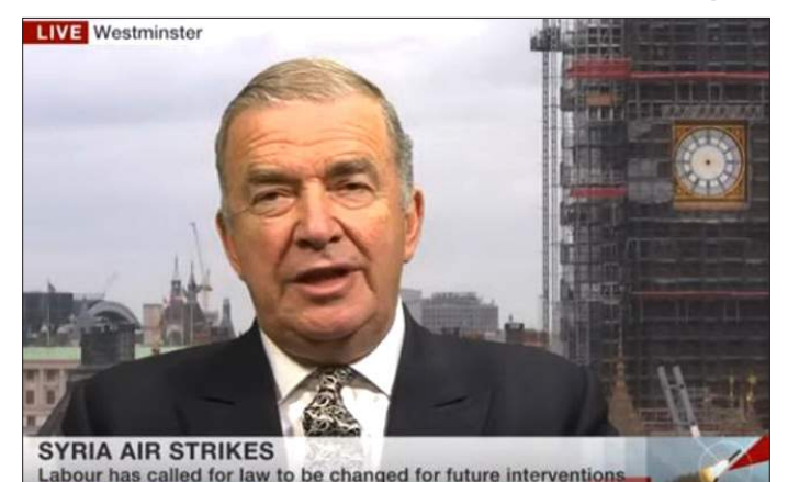
Former Admiral Lord West to BBC: An Assad chemical attack "doesn't make sense."

After the strike, instead of following the usual convention and falling in behind the government to "support the troops", Corbyn was unequivocal in his condemnation. "Saturday's attack on sites thought to be linked to Syria's chemical weapons capability was both wrong and misconceived", he said on 15 April. "It was either purely symbolic—a demolition of what appear to be empty buildings, already shown to be entirely ineffective as a deterrent—or it was the precursor to wider military action. That would risk