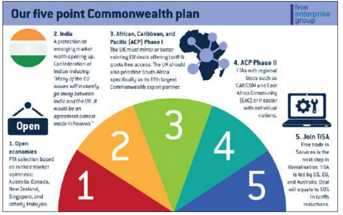
A graphic showing the five phases of Britain's plan to expand its trade outreach via the Commonwealth.

"Churchill shifted in his armchair. 'The British Empire trade agreements', he began heavily, 'are-