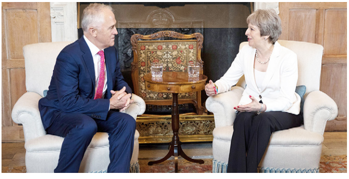
Turnbull and May at Chequers, the PM's country home, after discussing cyber security and trade.

Turnbull welcomed a greater British presence and expanded influence in the Asia-Pacific, both through expected UK membership in the TPP and an expansion of UK embassies throughout the region. Nine new embassies were announced by the May government, including in Vanuatu, Samoa and Tonga (plus four in the Caribbean and two in Africa).