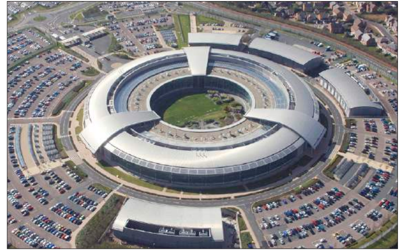
The royal commission into the Christchurch terror attack must look beyond New Zealand security agencies to the role of the Five Eyes intelligence alliance, directed out of British Government Communications Headquarters (GCHQ), shown here. The extensive alliance has the capability to monitor communications of potential terrorists worldwide.

"The question the commission must answer is this: given the Five Eyes' awesome capability to collect, store and analyse communications virtually worldwide, and their purported recent focus on right-wing extremists,<sup>1</sup> how is it that they missed ... Tarrant, whose suspicious movements around Europe, repeated contacts with white-supremacist groups, and statements of homicidal intent on web forums should have raised all manner of red flags? Or, giv-