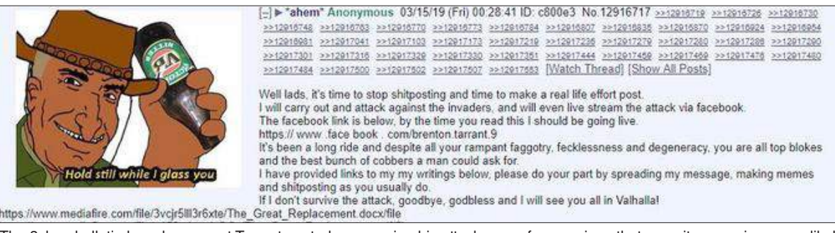
The 8chan bulletin board comment Tarrant posted announcing his attack, one of many signs that security agencies are unlikely not to have noticed.

line activity leading up to the attack was so blatant that it should have set off sirens in GCSB. Tarrant had for some time been active on a notorious ethno-nationalist/white supremacist discussion group (or "board") on internet forum 8chan, dedicated to encouraging acts of terrorism against non-whites anywhere in "European lands" (which by their definition somehow include Australia and NZ). Two days before the attack , Tarrant posted photographs there and on Twitter of his guns, magazines and other kit covered in anti-Muslim slogans and threats; the names of other white supremacist killers, including Anders Breivik, the Norwegian neo-Nazi who killed 77 in Oslo and Utoya Island in 2011; and references to the Crusades.