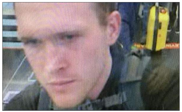
CCTV footage of Brenton Tarrant entering Turkey in 2016; Tarrant was involved in right-wing Serbian nationalism, which included deep animosity towards Turkey. Turkey released this image the day after the massacre, which is another hint that he was likely being monitored by intelligence agencies, Turkey being a member of NATO.

The Australian reported 18 March that European intelligence agencies tracing Tarrant's ramblings across the continent had discovered an obsession with the Balkans region and its long history of battles between various Muslim political entities (mainly the Ottoman Empire) and so-called "Christian Europe". The Australian reported: "Such was Tarrant's deep and sometimes obscure knowledge of Balkan war history going back centuries