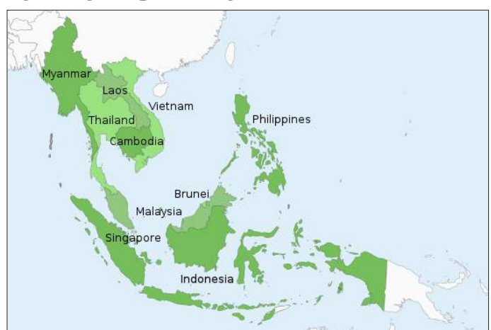
ASEAN nations.

Praising the Belt and Road Initiative, Lee said that China's growing economic influence in the region is a natural extension of its own development, and it is "far better that China's economy be integrated into the region, than for it to operate on its own, by a different set of rules. ... There will be no good outcome if Asian countries are split between two camps".