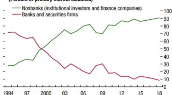
2. US Leveraged Loan Investor Base: Banks versus Nonbanks (Percent of primary market issuance)

US bank leveraged loan issues are being surpassed by non-banks. (IMF Global Financial Stability Report 2019)