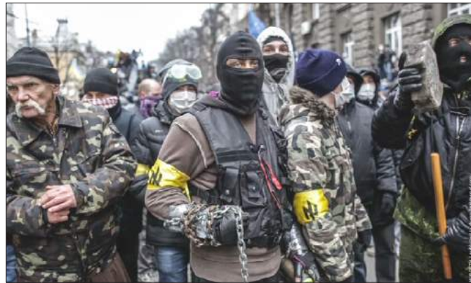
The “Right Sector” paramilitary group was key to the violent “Euromaidan” coup of 2013-14. Their armband displays the Nazis’ Wolfsangel, which is simultaneously the acronym “NI” for Dmytro Dontsov’s “National Idea”

In the 2009 Parliamentary elections, Svoboda entered the Parliament and obtained Parliamentary immunity, substantial state financing, and guaranteed airtime. They proceed to hold their covens without any obstacles. They march through the streets with torches and under slogans like “Ukraine over All!” “Ukraine for Ukrainians!” “Glory to Ukraine, Death to the Enemies!” “Stab the Muscovites, Slash the Russians, Hang the Communists!” This a gross violation of the Ukrainian