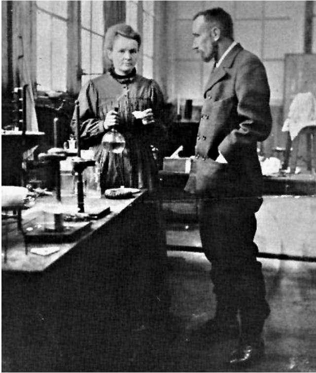
Marie and Pierre Curie's separation of the first gram of radioactive radium introduced a new physical principle, making a revolution in physical chemistry.

actor designs. Thus, the figures above need to be divided by 25, giving nuclear power, in the worst-case scenario, an energy density advantage over wood, coal, and petroleum of only 88,000 to 460,000. However, with fuel reprocessing, a form of recycling, the burn-up rate is nearly total. Because of the production of extra neutrons in the fission reaction, new fuel can be created by nuclear transmutation as the old fuel burns up. The full nuclear fuel cycle, employing reprocessing and fuel breeding, is a virtually limitless cycle. Nuclear is the only fuel that replaces itself as it burns.