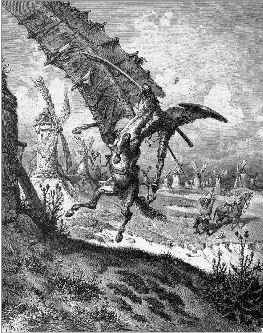
Gustave Doré illustration of Don Quixote, 1863 Don Quixote knew what to do with windmills.

primarily exported. Thus, the amount available per person for use in China is less than 0.25 kilowatts, about one-third of a horsepower. Taken over the full 24 hours, we can say that the average person in China has available to him the work of 1 horse, compared to the 12 horses available in the United States. The source of most U.S. manufactured products is the low-wage labor of millions of Chinese, many of them from families with no access to even the electric light.