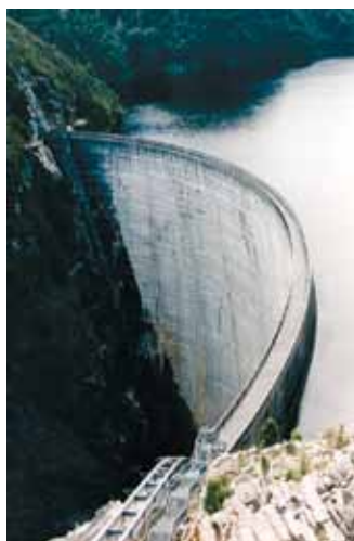
Premier “Electric Eric” Reece (left) enraged Prince Philip by refusing to back down on building the Gordon Dam (right).

Under Eric Reece, Tasmania’s Hydro-Electric Commission planned a three-stage development of Tasmania’s Southwest to achieve electricity production on the same scale as the world-famous Snowy Mountains Scheme, at one-third of the cost.