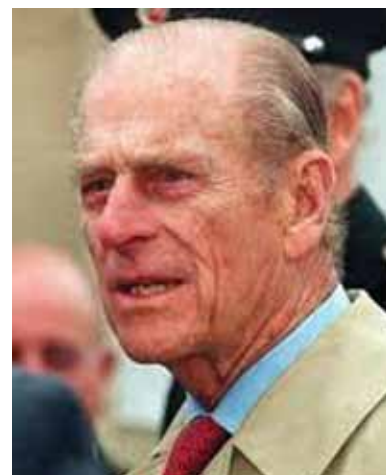
Prince Philip started the green movement to shut down developments that support growing populations.

However, after five decades of relentless green assault, Tasmania has the lowest population growth in Australia, an exodus of futureless young people from the state, and now imports its electricity from Victoria via Basslink.