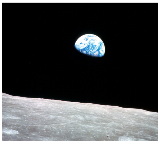
Apollo 8’s view of the biosphere of Earth from the Moon, December 1968. Human exploration expands our horizons—proving there are no limits to growth.

But if Prince Philip, Her Majesty’s Anglican Church, the ACF et al. were genuinely worried about “overpopulating” our planet Earth, wouldn’t they therefore be among the first to champion American physical economist Lyndon LaRouche’s proposal for the near-term colonisation of Mars, as a prelude to colonising some of the billions of stars which make up each of the countless billions of galaxies in outer space?