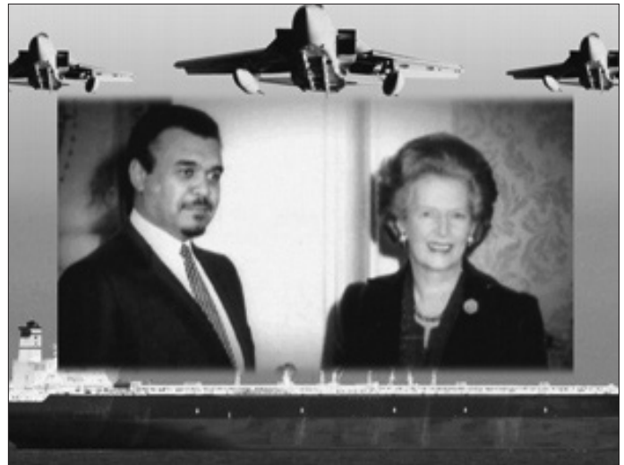
Prince Bandar and his friends: George W. Bush, Prince Charles, and Margaret Thatcher. Bandar is the unrivalled star of the 28 pages, named as financing two Saudi intelligence officers who assisted the 9/11 hijackers based in San Diego.

is the deeper scandal of the 28 pages, and the principal reason for the cover-up. The payments, which were made from a confidential account at the Bank of England administered by the UK Ministry of Defence, were corrupt kickbacks to Prince Bandar from the proceeds of the al-Yamamah oil-for-arms deal, the UK’s biggest-ever arms contract, which Bandar had negotiated with then British Prime Minister Margaret Thatcher in 1985. 2 Under the deal, British defence