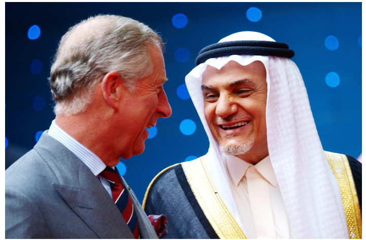
Prince Charles and Saudi Prince Turki bin Faisal, the former head of Saudi intelligence who resigned his position only ten days before 9/11; Turki has been named as a financier and coordinator of 9/11.

1) Beginning with Prince Charles, the Western sponsors