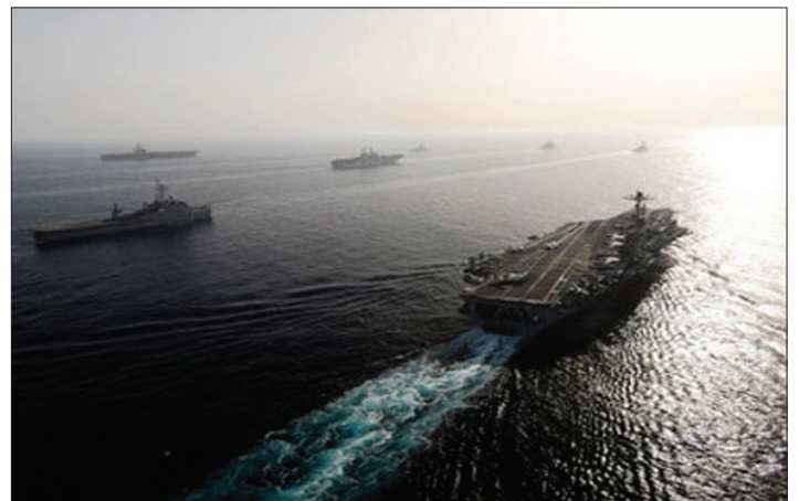
An armada of British and American naval power is amassing in the Persian Gulf. They will participate in the largest-ever 25-nation, US-led manoeuvres in the region, based upon the threat of Iranian blockades and attacks.

"According to senior diplomatic sources, the US State Department had credible information 48 hours before mobs charged the consulate in Benghazi, and the embassy in Cairo, that American missions may be targeted, but no warnings were given for diplomats to go on high alert and 'lockdown', under which movement is severely restricted." ( The Independent, September 14, 2012. )