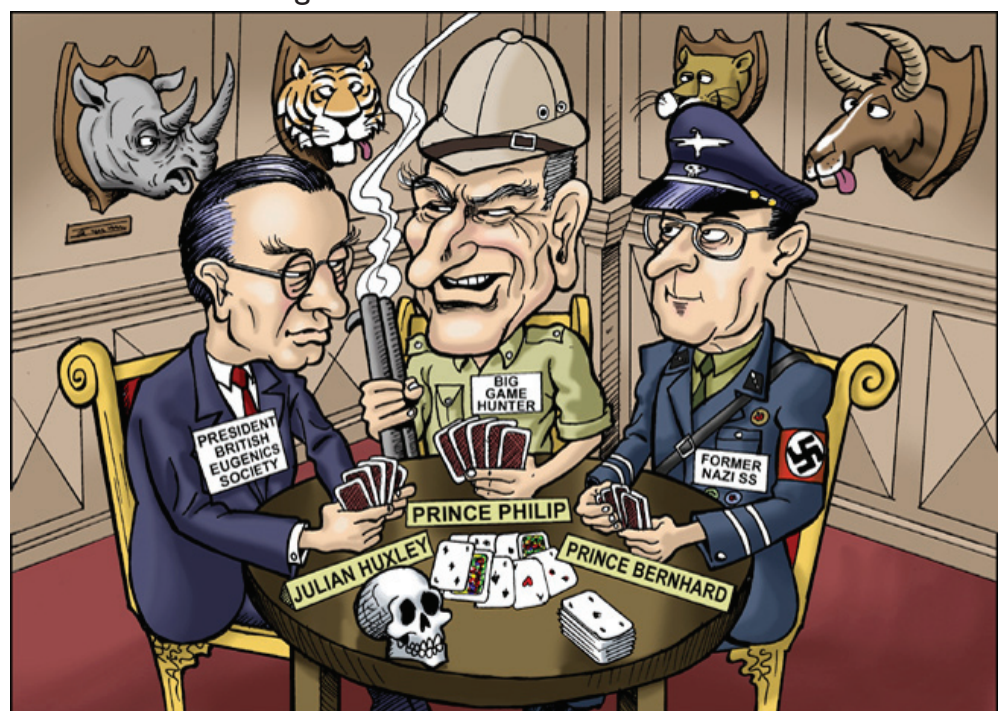
The 1961 founding meeting of the World Wildlife Fund

“Where are the regulations for this kind of funding?” he demanded. “What should apply here is truth-in-labelling laws, so the ACF are forced to declare that their policies will kill people. It’s mandatory for cigarettes, so why not the ACF? After all, their policies will assuredly kill millions.” He concluded, “Governments that conspire against their own populations should be held to the Nuremberg standard of crimes against humanity. If the various state and federal governments don’t like to hear that, they should stop funding these genocidalists.”