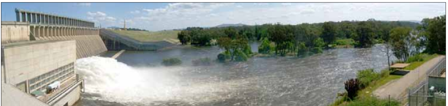
The Hume Dam. There is no shortage of water in the Murray-Darling Basin at the moment, but much is just being let out to sea.

"But the present, actually British-orchestrated plot between the MDBA and the banks, as evidenced in the MDBA's recent 'Rizza report', is truly hideous, actually genocidal in the old British imperial tradition of 'land clearances'. Among other things, it proves beyond any doubt that all of the present hoopla about 'consultations', parliamentary or other 'hearings', 'revising the MDBA Guide', etc., are just an orchestrated dog-and-pony show to beguile the public—and the banks' intended victims—while the devastation proceeds. And both the Government and Opposition know this full well because they have debated the 'Rizza report' in Parliament, even while covering up its actual stunning import so no-one else would read it, as I just have, belatedly. They are therefore fully conscious—presuming that they are not brain-dead—that the banks will decimate the Basin through foreclosures long before any 'revised Guide' goes into effect. As we in the CEC have documented in our latest New Citizen newspaper, the British Crown is orchestrating this plot not so much to grab the water, as to destroy our national food supply, so as to destroy our sovereignty in the present deepening global financial collapse. So, Ms. Gillard, Mr. Abbott et al., why don't you act on behalf of Australia's national interests for a change? If you