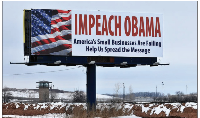
The Winnebago County, Oshkosh, Il, USA. Feb 2010