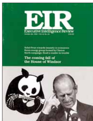
“House of Windsor” report, 1994.