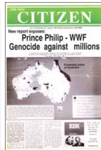
Tens of thousands printed, 1994.