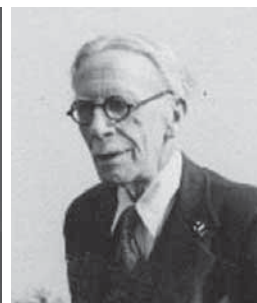
The theories of Rudolf Clausius (l.) and Lord Kelvin (c.) on “heat death” or an “equilibrium state” were extrapolated by Sir Arthur Tansley (r.) to a mechanical construct for living organisms, which he named “ecosystems”.

tian”, that insofar as Darwin had discredited the notion of “design” (universal lawfulness), then, “if you accept the ordinary laws of science, you have to suppose that human life and life in general on this planet will die out in due course: ... it is a stage in the decay of the solar system; at a certain stage of decay you get the sort of conditions of temperature and so forth which are suitable to protoplasm, and there is life for a short time in the life of the whole solar system. You see in the Moon the sort of thing to which the earth is tending—something dead, cold, and lifeless.”