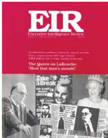
“Shut This Man's Mouth”: EIR reports on threat to LaRouche's life in British magazine Take a Break , 1999.