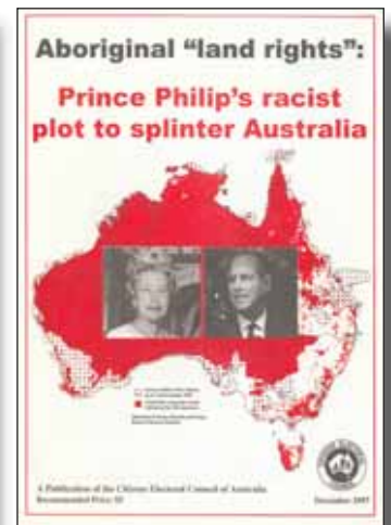
The CEC’s December 1997 exposé.