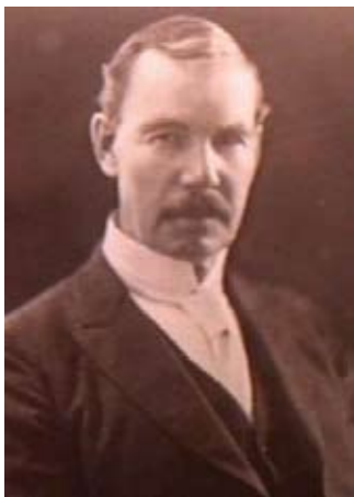
Arthur Cecil Pigou,

The policy has its roots in the fascist ideas of British economist and Cambridge University professor Arthur Pigou, who worked closely with John Maynard Keynes during the 1930s. In a 1920 book entitled, The Economics of Welfare , 1 Pigou argues that the way to change a behavior, is to tax it out of existence. With cap and trade, you tax energy until it becomes too expensive, and this, in turn,