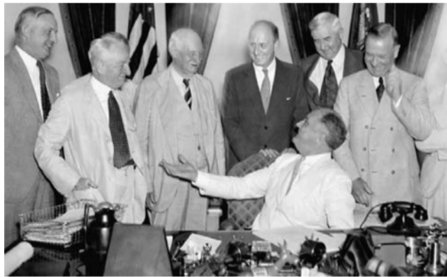
President Franklin D. Roosevelt signed the Glass-Steagall Act on 16 th June 1933 which outlawed predatory speculation by Wall St.

The eruption of the eurozone debt crisis in early May