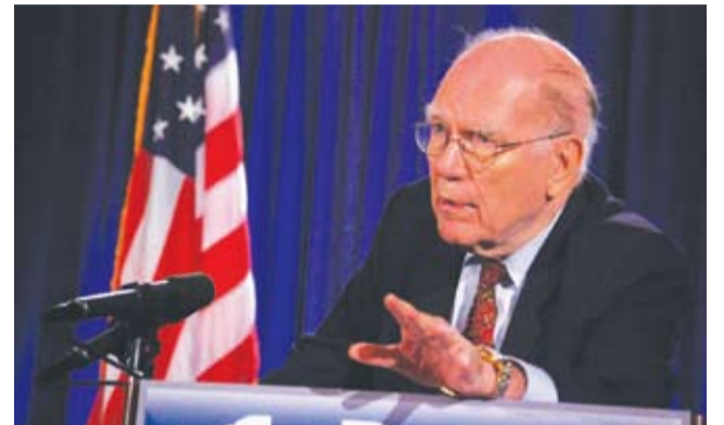
American statesman and physical economist Lyndon H. LaRouche, Jr.

currencies and other financial instruments. As investment drained out of the real physical economy of agriculture, industry, and infrastructure, into speculation, financial shocks came one after another in rapid succession. These included: the October 1987 U.S. stock market collapse, the greatest ever; the near col-