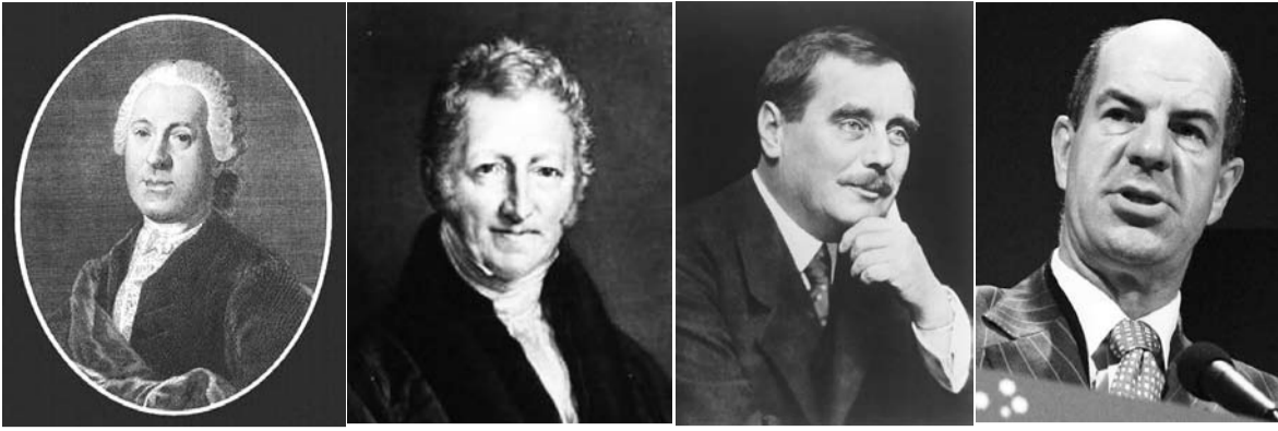
Venetian Giammaria Ortes; East India Company man and Anglican Parson Thomas Malthus; Fabian H.G. Wells; Fabian Kelvin Thomson