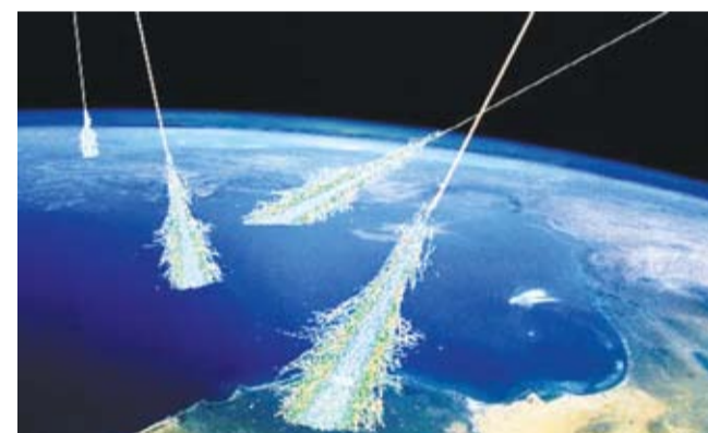
An artist's illustration of cosmic rays, just one form of cosmic radiation, striking molecules in the Earth's upper atmosphere producing cascades of lighter particles called an air-shower which then interact with the biosphere.

A rising rate of potential relative population density is the essential metric of a healthy economy, as LaRouche has stressed. But it is also urgently necessary