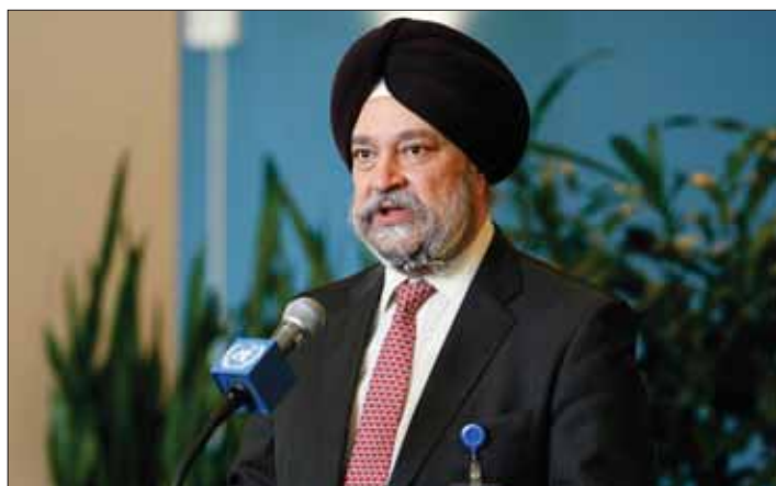
India’s Permanent Representative to the UN, Hardeep Singh Puri, has challenged R2P.

“You know, whenever someone aspires to attain a much-desired end, any means will do. As a rule, they will try and do that by hook or by crook—and hardly ever think of the consequences that will follow. That was the case during the Afghan war after the Soviet Union in 1979 sent its troops to Afghanistan. At that time, our current partners supported a rebel movement there and basically gave rise to al-Qaeda, a United States pet project that