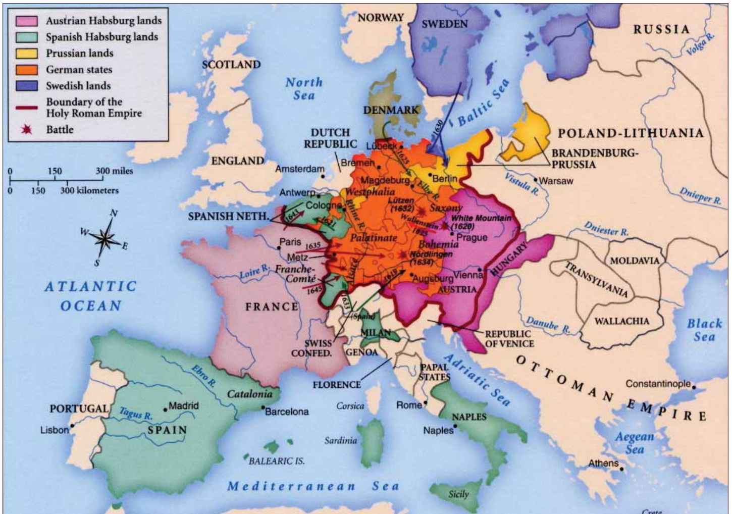
The Treaty of Westphalia was signed by the Holy Roman Emperor and the King of France and their respective allies after several years of negotiations.

be so honest and seriously guarded and nourished that each part furthers the advantage, honour, and benefit of the other... A faithful neighbourliness should be renewed and flourish for peace and friendship, and flourish again."