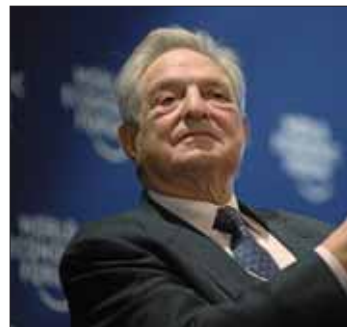
Henry Kissinger and George Soros have also been key proponents of the Responsibility to Protect.

international law by their military campaigns and assassinations in countries like Libya and Syria.