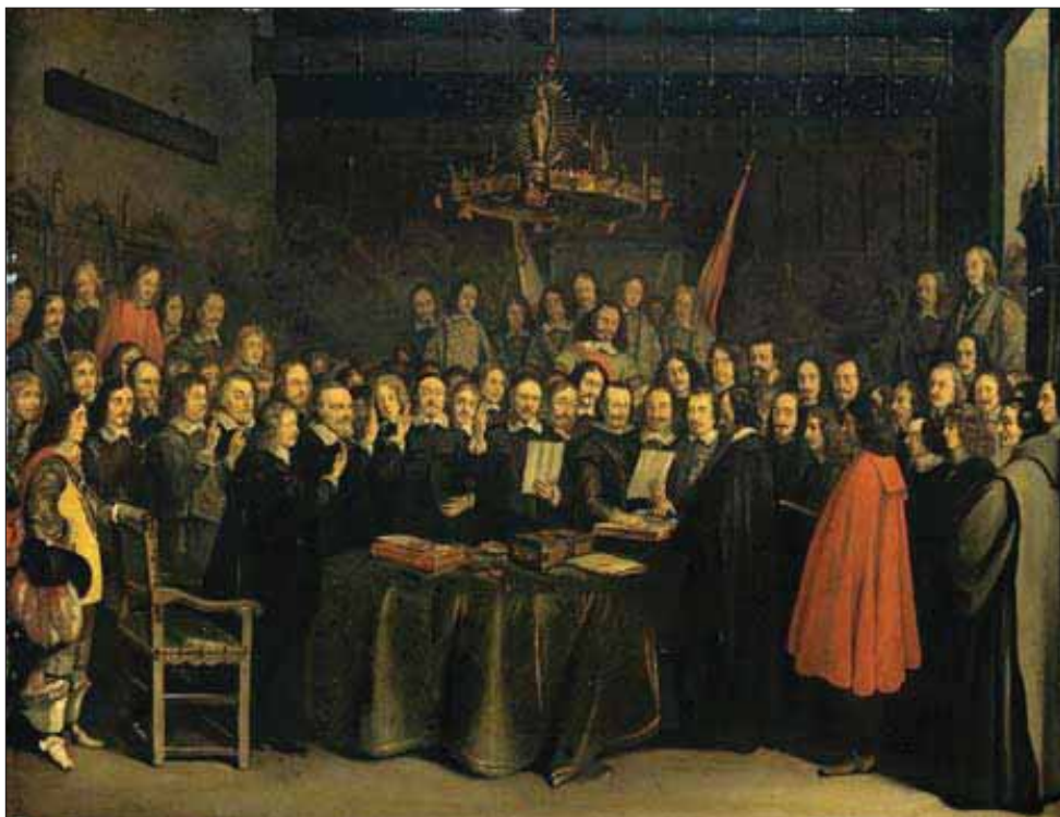
The Treaty of Westphalia, by Gerard Terborch, depicts the signing of the historic treaty in 1648.

So Russia and China are being bullied to drop their resistance to regime change, by nations which are pushing to destroy the notion of sovereignty in favour of an idea championed by Tony