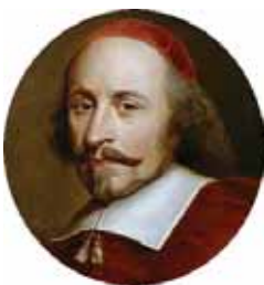
Cardinal Jules Mazarin, 1602-1661.

Well, it's a pretty crucial institution though, even if it ain't working so good at the moment. But a government can only really function if it has the authority to make decisions and follow through on those decisions without interference—that is, if it has sovereignty .