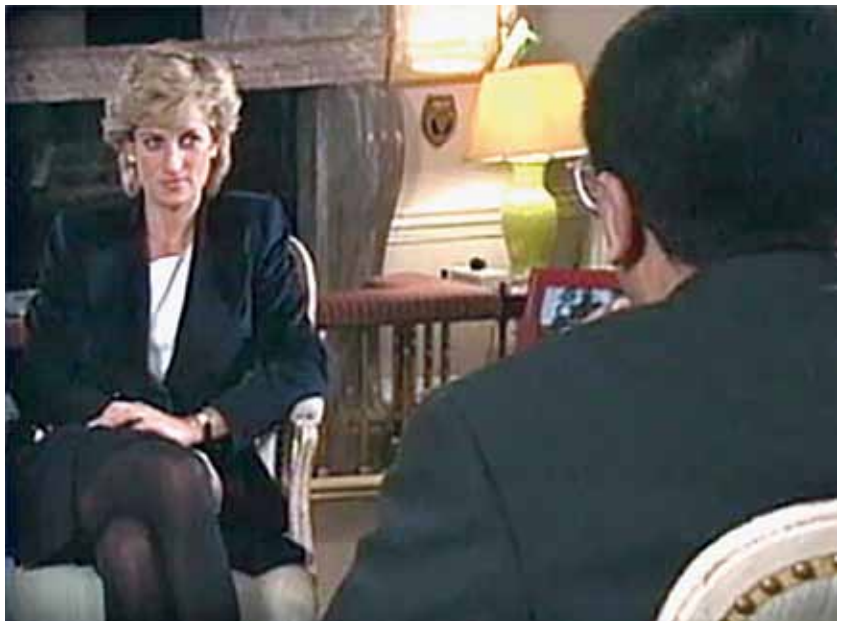
Princess Diana’s prime time BBC Panorama interview, Nov. 20, 1995, terrified the Crown.