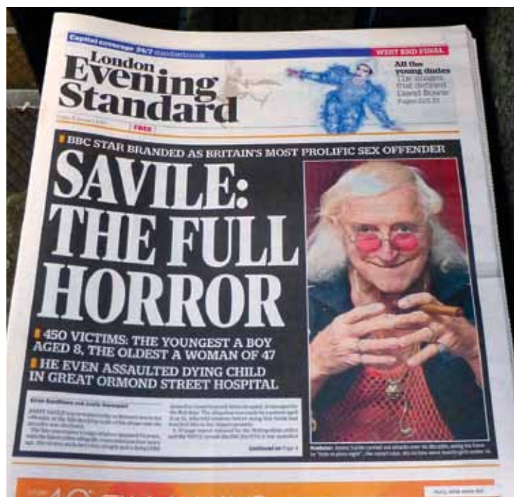
The London Evening Standard in 2013, after deceased entertainer Jimmy Savile was exposed as a sexual predator of children, whom the Metropolitan Police described as an abuser “on an unprecedented scale”; Savile had been Prince Charles’s friend and “aide” for over three decades.

high society, including within Buckingham Palace, continue to rock the UK. At the same time, Catherine Mayer’s biography has drawn attention to the status Prince Charles accorded the late Jimmy Savile—a TV personality and notorious pedophile (exposed as such only after his death in 2011)—as friend, confidant, adviser, and even “key aide,” as one newspaper account put it. A 2013 Scotland Yard report cited abuse by Savile “on an unprecedented scale,” shown in complaints by 450 people, covering the period 1955-2009 and victims aged 8 to 47.