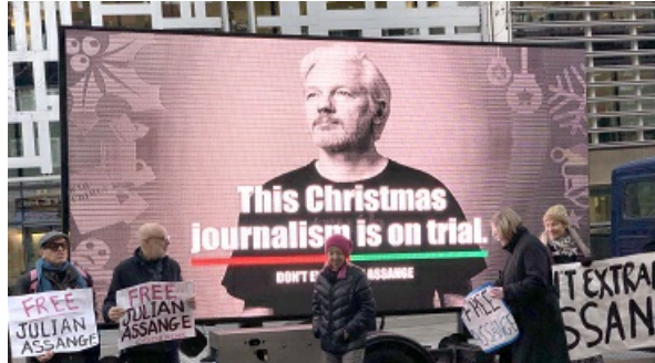
Campaigners to stop Assange being extradited, outside the Home Office.

Australian citizen Julian Assange, journalist and anti-war activist in his capacity as founder and chief editor of WikiLeaks, have been raised with increasing urgency in recent weeks. On 23 November scores of physicians released an open letter to UK Home Secretary Priti Patel and Shadow Home Secretary Diane Abbott, "to express our serious concerns about the physical and mental health of Julian Assange". They cited the eyewitness accounts of former Ambassador Craig Murray and others, of Assange's apparent conditions during a 21 October case management hearing in Westminster Magistrates Court. (Murray's report was excerpted in " Assange in Court ", AAS, 30 Oct. 2019.)