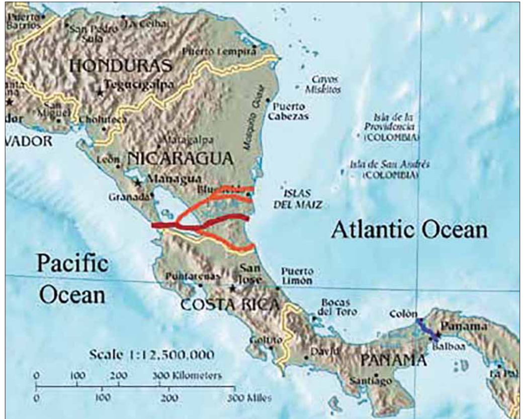
FIGURE 1. Route of the Great Inter-Oceanic Canal.

"Today we are a region where we defend the principle of sovereignty, where we hold up the region as a region of peace, and therefore it is not an accident that this project is being carried out when, in our Americas, we have succeeded in making this great historic leap towards integration and unity of all our peoples," Ortega said.